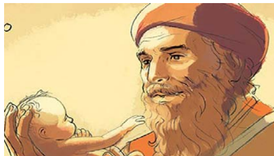
The Cantic of Zechariah